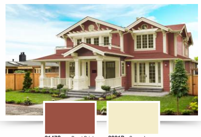
2147C Burnt Brick